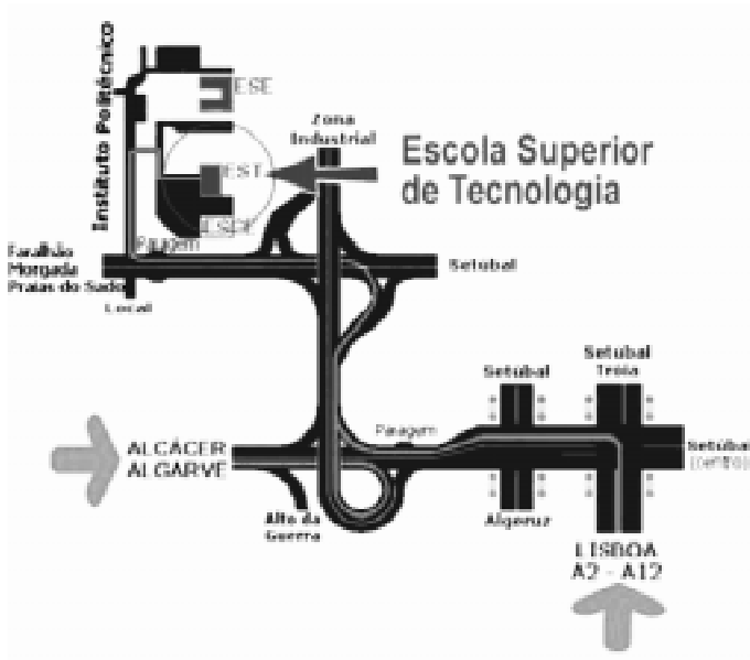
FIGURE 1: HOW TO REACH THE CAMPUS OF IPS