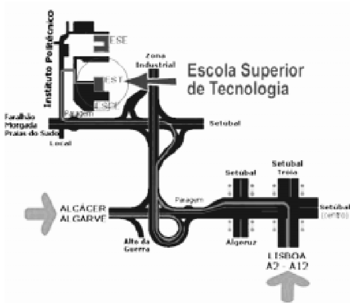
FIGURE 1: HOW TO REACH THE CAMPUS OF IPS